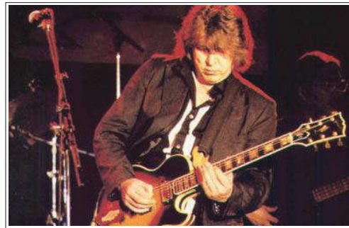
Who needs Wembley Stadium, when the DuPage County Fairgrounds rock!

• Mick Taylor - Guitarist for the Rolling Stones from 1969 to 1974. Left the