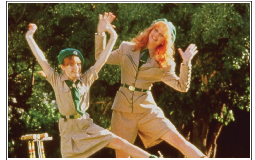
This is not what my agent promised.