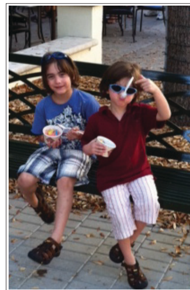
Life is good.