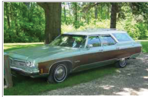
Saturday night memories

My boys love their Sketcher shoes that light up and want a new pair every month. When I was a youth in the 70's I yearned