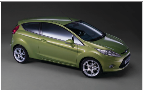
American Graffiti 2...can you imagine?

These choices or priorities, or lack of them, has changed drastically over time. As I look upon my youth and think of the things I cherished compared to what is available today, I am amazed.