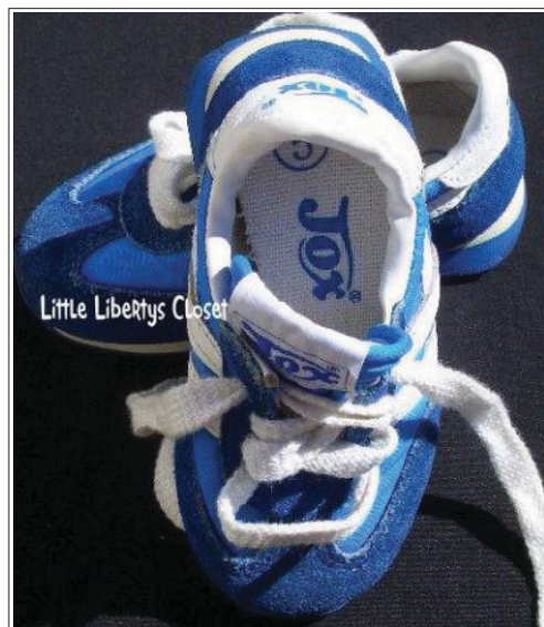
Every kids' dream

for a new pair of Jox by Thom McCann. Those sleek blue suede beauties with the slash emblem would keep me up at night. How cool would I look in the summer with my knee high striped socks flying down the street on my purple Sears bicycle with a banana seat? I maybe got a new pair once a year depending on how fast I grew. This was a particularly hard lesson. Invariably a 7 year old will get his blue suede beauties stained, and regardless how late he stays up at night spraying suede guard on the shoe and washing it with water the stains will not go away and may actually make things worse. No, you don't get new shoes when