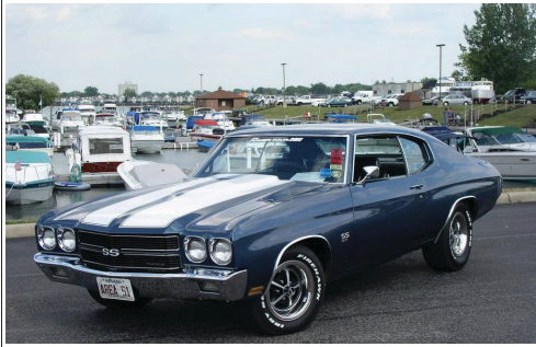
Ain't that America

Who can forget the Camaro Z28, Chevelle, or Mustang back in the day? Granted I never owned one of these cars; rather when I was old enough to drive I had to settle for my parents green Oldsmobile Custom Cruiser station wagon. Don't laugh, on Saturday's the car was packed with coeds and it had an 8-track player! So there! AC/DC and the Rolling Stones would be blaring regularly.