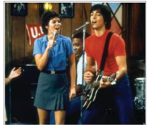
Joanie Loves Chachi